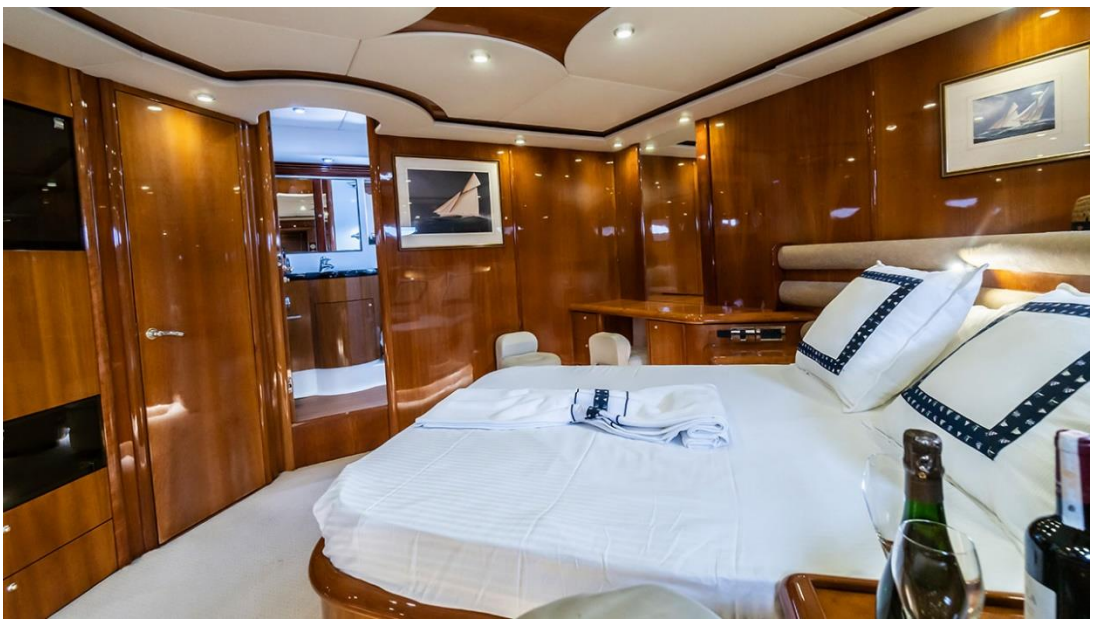
25 METERS | 4 CABINS | MOTORYACHT