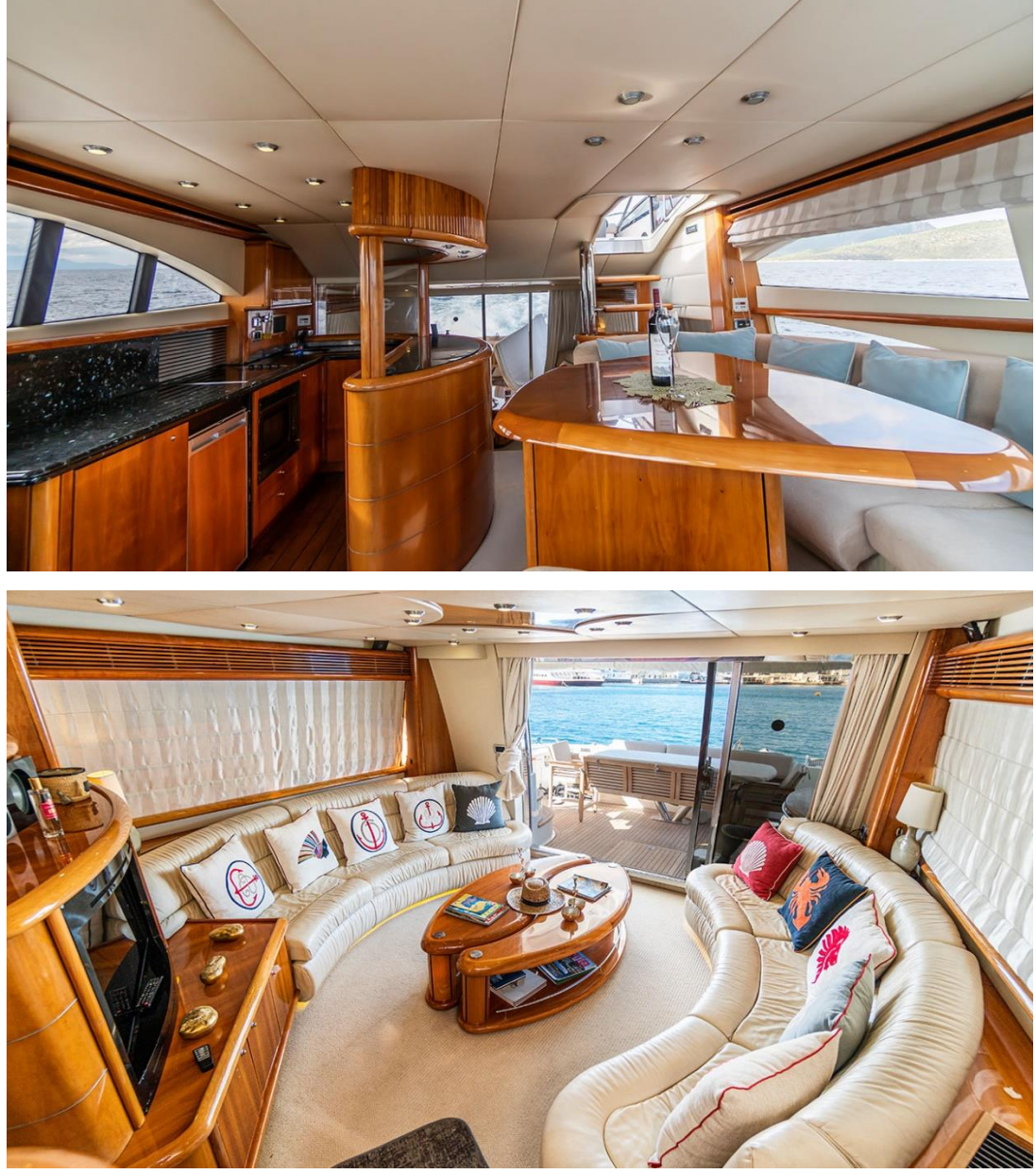
25 METERS | 4 CABINS | MOTORYACHT